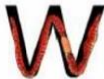
Down up, down up