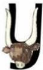
Down a horn, up a horn and under the yak's head